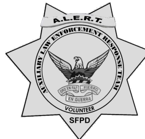
Non-Sworn Civilians, Cadets, and Volunteers