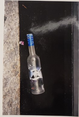
FOUND ON SCENE