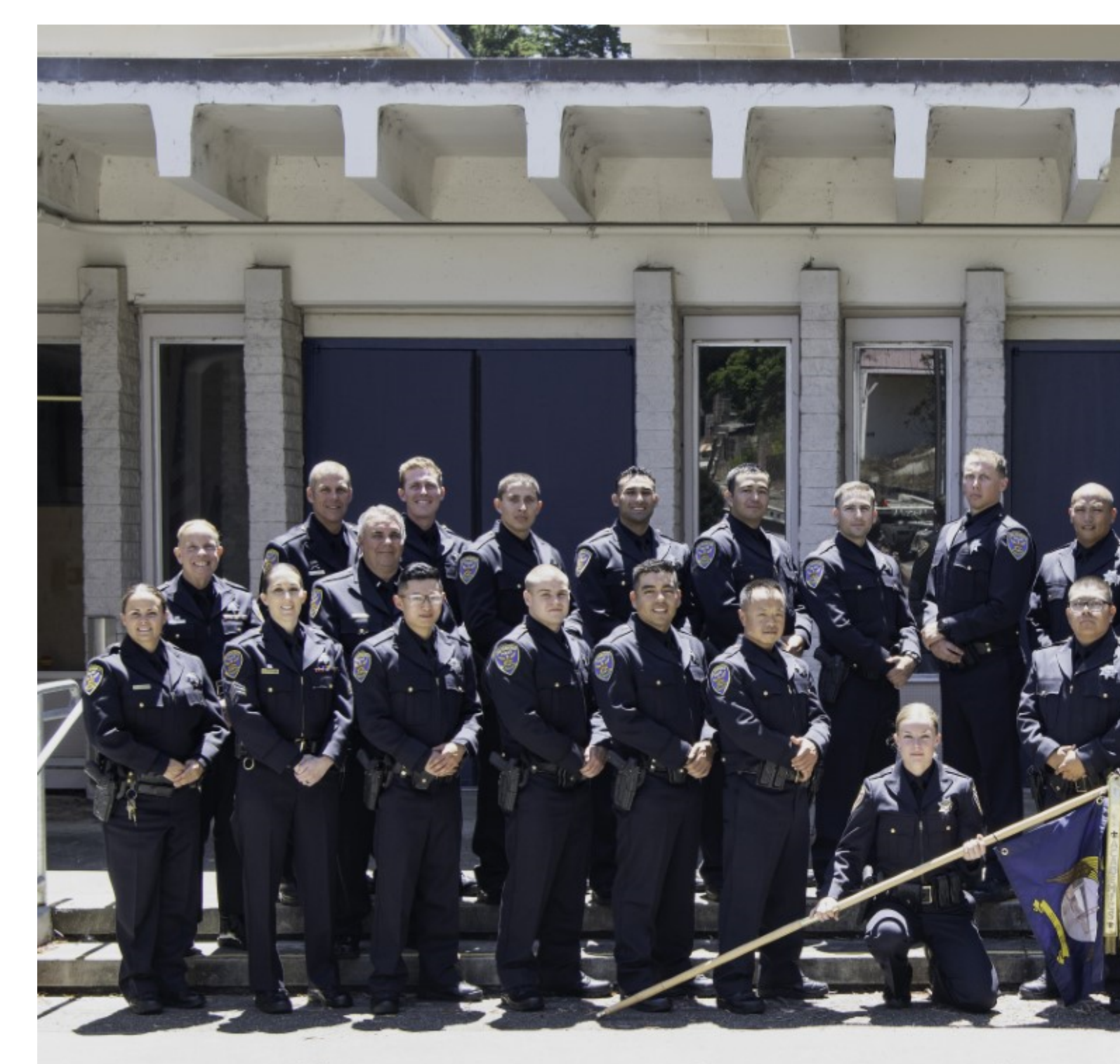
San Francisco Police 264<sup>th</sup> Academy July 26<sup>th</sup>, 20