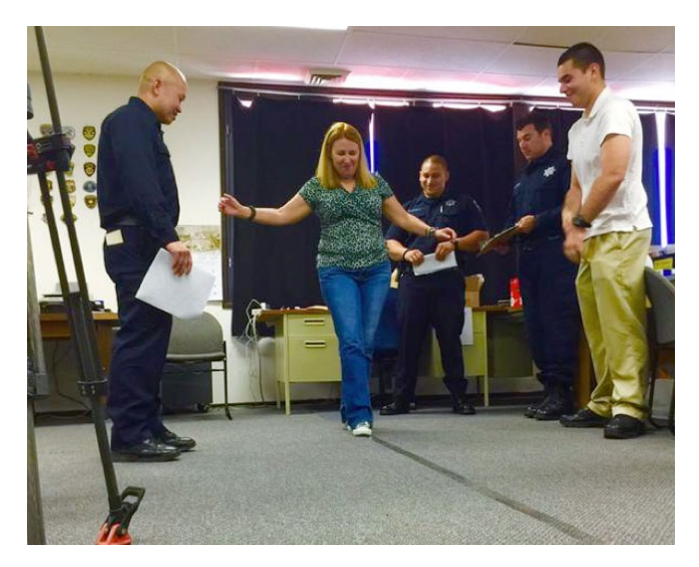
Tags Announcements News Release